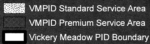
Exhibit A - Vickery Meadow PID Boundary Map

DALLAS ECONOMIC DEVELOPMENT Area Redevelopment Divisor, 214.670.1685 dallas-ecodev.org Created 07/2015