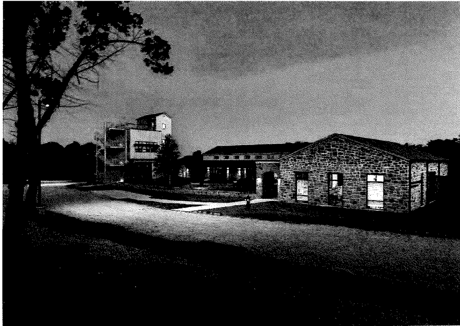
Welcome Center, Program Center, and Observation Tower