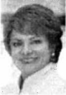
Pauline Medrano Mayor Pro Tem Council District 2