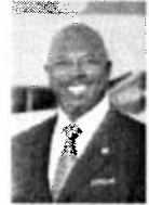
Tennell Atkins Deputy Mayor Pro Tem Council District 8